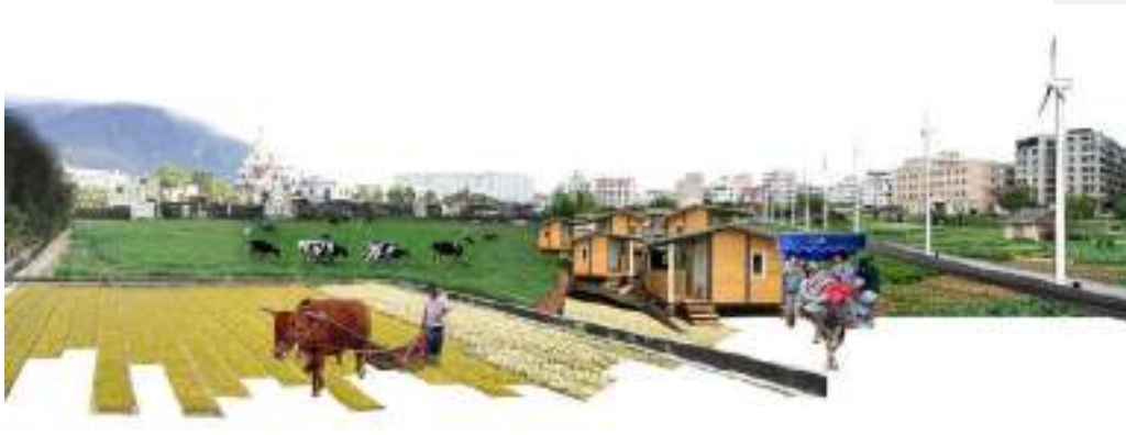
Figure 6. An alternative scenario—Dujiangyan, Sichuan Province: an tourbanistic agropolis for 2012, which integrates sustainable agriculture economy and landscape development and the government’s touristic and urbanistic ambition into the urban future