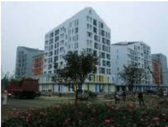
Figure 3. Post-disaster reconstruction housing project in Dujiangyan, Sichuan Province in 2010