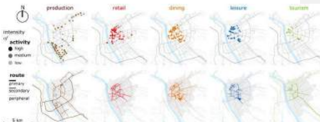
Figure 4. The original urban systems of Dujiangyan, Sichuan Province Brown: production; red: retail; orange: dining; blue: leisure; green: tourism. The