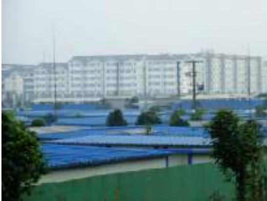
Figure 2. Relief housing agglomerations beside transitional disaster shelters in Dujiangyan, Sichuan Province in 2009