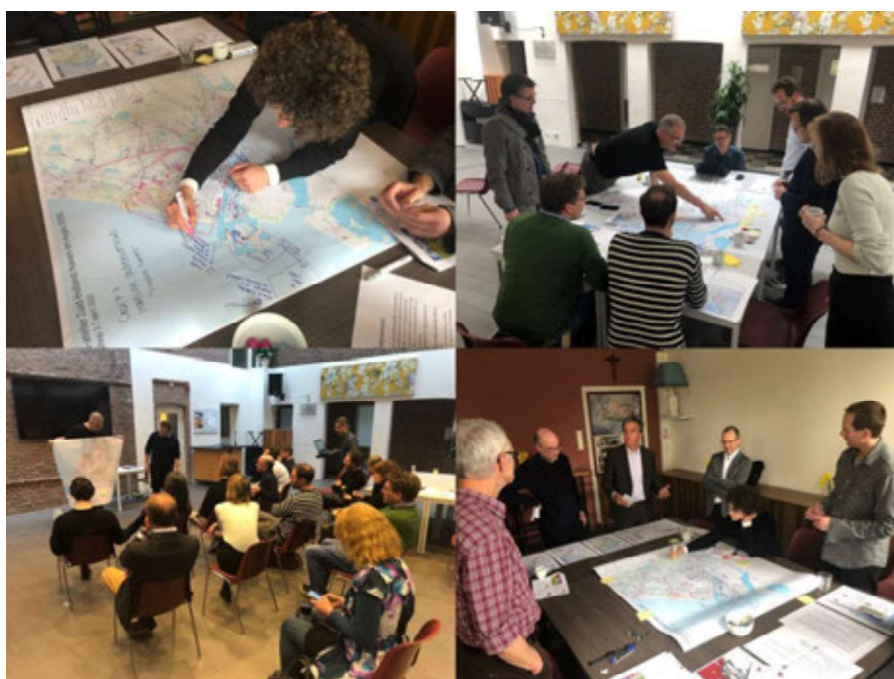
Figure 4: A scenario workshop in progress, source: PBL.

The development of the story lines of the scenario's and the maps was an interactive and participatory process together with experts and stakeholders, including policymakers from national, regional and local level. In a series of national and regional workshops, preliminary scenario narratives and maps were tested, discussed and refined (see Figure 4). After the workshops, the project team finalised the narratives of the scenarios and the maps for the publication of the project in a book and a website with an interactive map viewer.