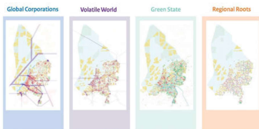
Figure 3: Conceptual maps of the four spatial scenarios, source: PBL.

Whereas the report Rehearsing The Future didn't include maps of the possible future spatial land use, the ambition of the Spatial Outlook 2023 was to create four integral maps of how the land use of the Netherlands could look like in 2050, including all five main themes of the research and also including the Dutch parts of the North Sea which is often neglected in spatial studies of the future. Maps, with their ability to convey spatial relationships and patterns, are powerful tools to develop spatial scenarios and to help to communicate and discuss the content of the scenarios with policymakers, planners and the public (Salewski, 2012).