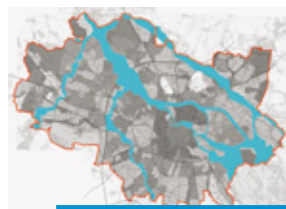
City scale - blue voids