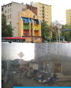
A void we don't talk about