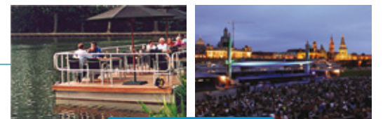
RETHINK - blue voids