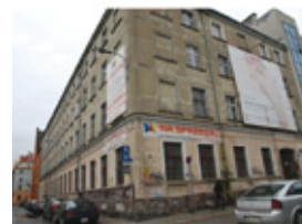
City management and governance voids

City management or governance voids result from city council policies of dealing with voids. Wrocław has chosen the easiest way to cope with its voids (mainly public property) by putting them on the free market.