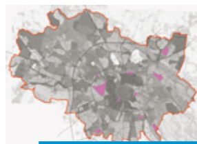
City level - industrial voids