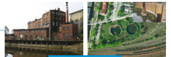
REUSE - industrial voids

We introduced the theme of urban voids and gave examples on how to shape them. We see an opportunity for a system that will elaborate these voids, rethink them and reshape them. This system will be a coherent tool for the future development of the city, relying on Wrocław as an organism capable of using the potential of its existing city structure. It is time to shape up the void.