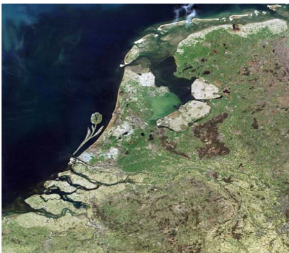
Project of a Tulip Island for windfarms in Netherland (Innovatieplatform, 2007-09)

But we can also see the opposite phenomenon at work in the relationship between ecology and esthetics: the “green-washing” of high environmental impact projects, where the drawings depict greenery shielding buildings, production areas and shopping centers from view, and flower beds bordering the new infrastructures. But the ornamental effect masks the irremediable consumption of land, water and energy. And finally, we have projects where nature is reduced to mere symbol: the new artificial islands shaped like palm trees (Arab Emirates), or tulips (the Netherlands). The new landscapes that result are an artificial product, artificially maintained, but one that plays with stereotyped and globalized “green images”.