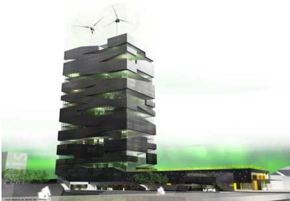
Project for a Biotower for city farming (from the site www.verticalfarm.com ) (SOA Architects)

What does an environmentally sustainable contemporary landscape look like? Despite the possible variety, as demonstrated by traditional landscapes regarded as being sufficiently in equilibrium with natural resources, the image that springs first to mind is that of a lush green place. For many people, the idea of sustainable landscape evokes strictly traditionalist archetypes, like the self-sufficient village whose inhabitants can go everywhere on foot, but brought up to date with bio-building, energy independence and maybe even growing one’s own food. The press will occasionally report a rare exemplification of this model in Nordic villages or sparsely populated areas. It is unlikely that images of urban or metropolitan landscapes will come to mind.