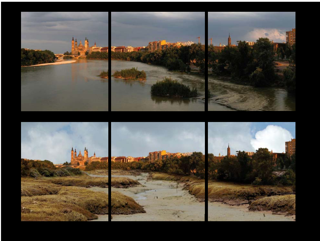
Simulation of climate change scenarios: “Río Ebro as it flows through Saragossa”; “After few decades with no action taken on climate change.” From: P. Almestre e M. Gómez, Photoclima (Greenpeace 2007)