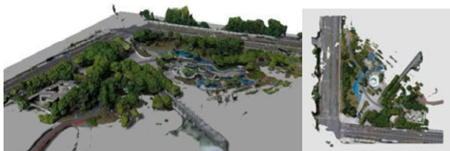
Fig.5 UAV 3D modelling and carbon sink assessment

physical characteristics - deduction of carbon sink logic". We employ quadcopter UAVs equipped with image sensors to scan on-site scenes and utilize the structure from motion (SfM) algorithm to construct three-dimensional scene scan models. Following manual and intelligent algorithmic repairs to these models, we utilize artificial intelligence image recognition algorithms to extract urban green vegetation from the models and identify vegetation types. Based on the physical characteristics of various types of vegetation, such as vegetation height and crown diameter, and biological properties such as chlorophyll content per unit volume, we compute the carbon sink value of urban green vegetation. Through this methodology, we achieve a detailed understanding of carbon sequestration dynamics at the microscale, providing valuable insights for urban planning and environmental management strategies.