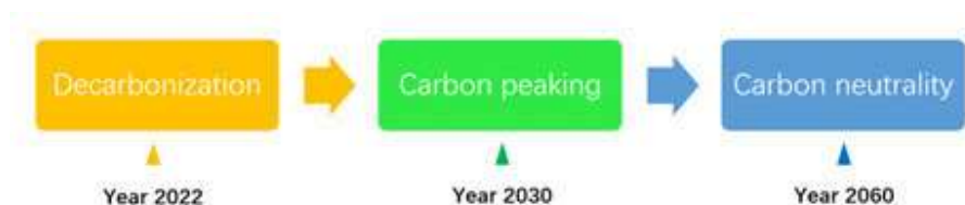
Fig.1 Shanghai's carbon peak and carbon neutrality goals and plans

promote green technological innovation, and strengthen carbon trading and carbon market construction.