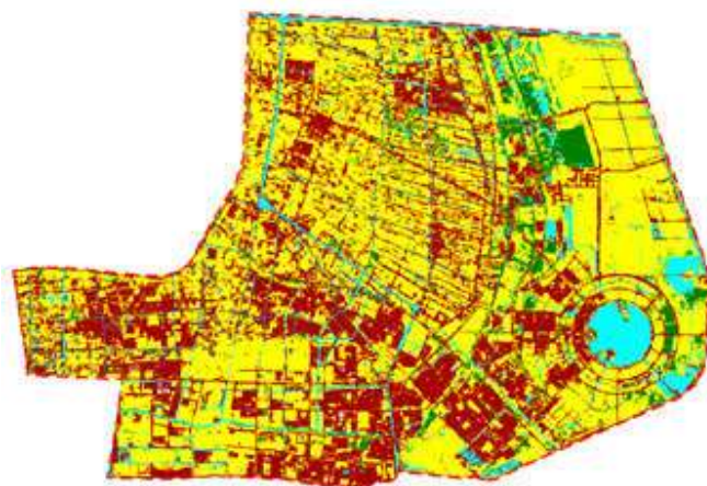
Fig.2 Land Spatial Distribution of Shanghai's Nanhui New Town

Quantitative analysis revealed significant carbon stocks and fluxes within Nanhui New Town. The predominant arable land presents a substantial carbon sink potential, with estimates suggesting carbon sequestration rates of up to 62.7 metric tons of CO 2 per hectare annually through improved agricultural practices and afforestation initiatives. However, the uneven distribution of forest and grassland areas poses challenges to optimizing carbon sequestration across the landscape. The presence of water bodies contributes to carbon storage through aquatic ecosystems, with estimates indicating carbon sequestration rates of 34.2 metric tons of CO 2 per year. Furthermore, river network density influences carbon cycling dynamics, with higher densities facilitating the transport of organic carbon and promoting carbon storage in aquatic environments.