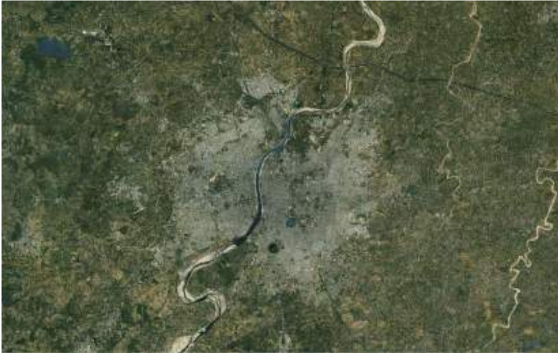
Figure 4. Aerial view of the city of Ahmedabad.

In the relation between the river and the canal the relevance of the scale issue becomes evident: as a matter of fact, a connection has been created between the Narmada Canal, stretching from the eastern to the western border of Gujarat, that is to say, between the Sardar Sarovar Dam (or Narmada Dam) to the arid region of Kutch, at the border with Pakistan.