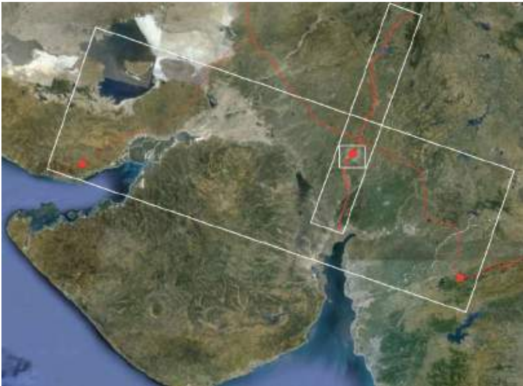
Figure 5. The city, the river basin, the Narmada canal (authors elaboration on Google Maps, 2011).

While introducing such concept, Smith actually redefined scales as socially constructed, historically contingent, politically contested rather than related to fixed boundaries. One of the most engaged authors who tried to summarise the debate about scales (and the 'politics of scale') is certainly Neil Brenner (1998; 2004) whose works mainly aim at questioning the mainstream literature about globalisation and at investigating the transformation of various scales (especially the scale of the state) under contemporary capitalism. Even though large part of the literature about globalisation and world cities tends to depict the State as a weak actor that is retrenching and ultimately losing its power in a growing "space of flows" (Castells in: Brenner, 2004), Brenner argues that the State is actually just changing its (spaces of) actions, as suggested by Lefebvre already in The production of space : "Each new form of state, each new form of political power, introduces its own particular way of partitioning space, its own particular administrative classification of discourses about space and about things and people in space". Such process is thus defined rescaling (Brenner, 2004; Swyngedouw, 1999; 2004).