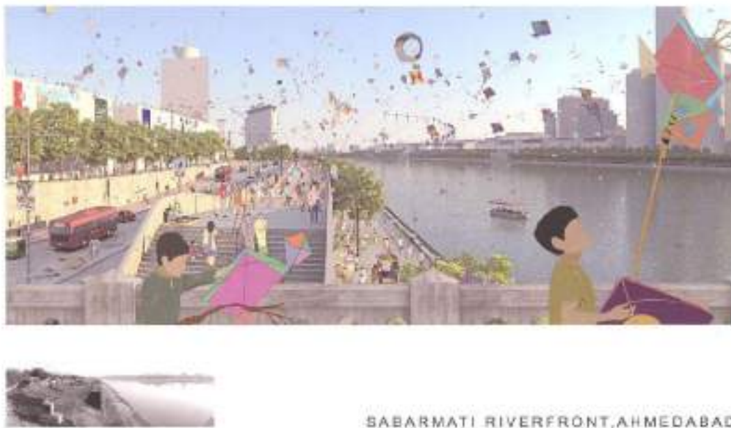
Figure 1. One of the visualisations of the future of the Sabarmati presented to the public by HCP in December 2011 (Pessina, 2012)

The Sabarmati River Front Development Project initiated in 1997 by the Ahmedabad Municipal Corporation (AMC) through the newly created Sabarmati River Front Development Corporation Limited (SRFDCL), is actually listed among the main projects to achieve the municipal vision of a “Vibrant Ahmedabad – Vibrant Gujarat” or of a “Greater Ahmedabad” (fig. 1) 3 .