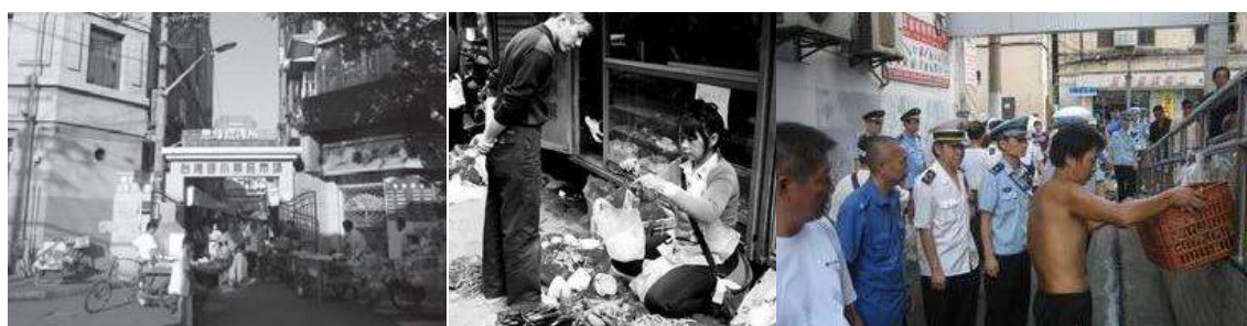
Figure 2-4 - Three Periods of Taiwan Road Food Market

The development of Taiwan road food market has gone through three periods: (1) after liberation period: small commodity market. Before liberation, there were fixed stores on both sides of Taiwan road. After liberation, sporadic mobile traders began to set up stalls on the streets. After the renovation movement around 1959, there were no signs of itinerant traders on the Taiwan road. (2) 1990s period: vegetable street. There is an emergence of mobile vendors, gradually increasing the size, forming a neighborhood vegetable street, which is the prototype of Taiwan Road food market. (3) Latest ten years: the street food market is still repeated. The relevant departments in recent years has carried out several campaigns and raids, the results were obvious but did not last long, the street market emerged again and again.