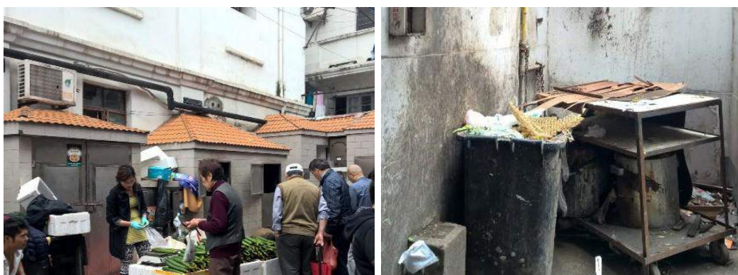
Figure 8-9 - Space Occupation And Poor Sanitary Conditions

Residents of the way to buy food is mainly divided into walking and non motorized vehicles. Stalls next to storage batteries, bicycles, motorcycles parked at random, affecting the passage of pedestrians. Some dealers transport tricycles to the goods parked in the trunk, the goods piled up in the residents of the import and export channels, traffic congestion will expand the scope of more. In addition, the key health problem is also plagued residents, we collect three large garbage Taiwan Road market operation of the manufacturing source: 1. vegetable stalls, this kind of garbage left by most vendors, daily life often leaves after withdrawal stalls with the garbage bin nearby. 2. fruit stalls, similar to the former one, the putamina number is larger in need of cleaning. 3. aquatic products stalls, the whole Taiwan Road food market, the sale of aquatic products stalls accounted for the total operating booth 1/6. The stalls for aquatic products are very humid, and the fish floor is the most important cause of flies and mosquitoes. From the business perspective, to solve the problem of aquatic products and health food category is relatively difficult.