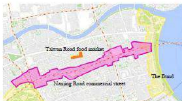
Figure 1 – The Location (Drawn by Author)

areas. Taiwan Road, a total length of no more than 200 meters, has now developed into the most important informal vegetable distribution center in the northeast of Huangpu District.