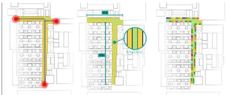
Figure 5-7 - Three Periods of Taiwan Road Food Market (Drawn by Author)