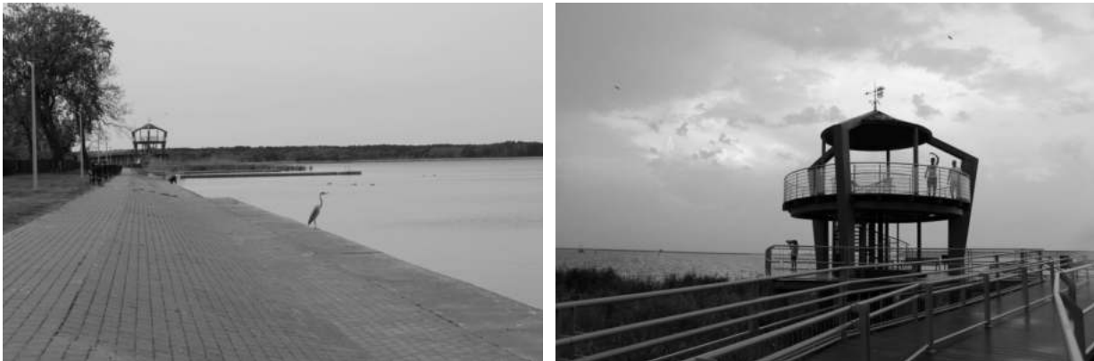
Figure 6 The view tower on the cape in Nowe Warpno

From 2004, when the revitalization was limited to the largest project structural funds, the social energy started changes in the private construction this action is realisation of dreams about living-improvement.