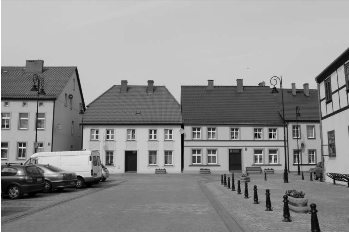
Figure 5 Tenement houses after revitalization co-financed by Community.

From 2004, when the revitalization was limited to the largest project structural funds, the social energy started changes in the private construction this action is realisation of dreams about living-improvement.