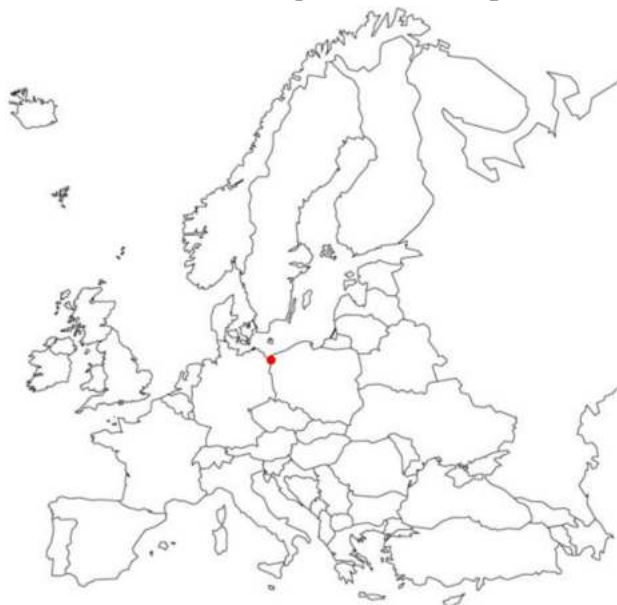
Figure 1 Nowe Warpno - location