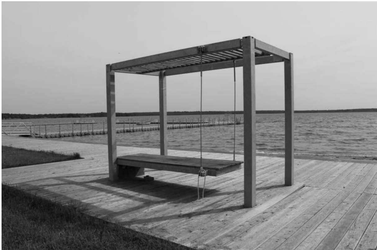
Figure Nowe Warpno - a place on the map of West Pomeranian Sailing Trail. Yacht Harbour Nowe Warpno. The beneficiary's name: West Pomeranian Regional Tourist Organization. Project No. 95254252,07 PLN; UE contribution: 35280000,00 PLN; time of realization 2009–2013

A town hall, a church and the public spaces underwent the renovation along the pier of the north port, to which leads today the Yachtsmen Avenue. A new pier was built on the northern coast of the cape finial with a view-tower was also built. On the southern coast a jetty was created and another section of waterside boulevards. This way the waterfront was developed, without the loss of their natural picturesque character.