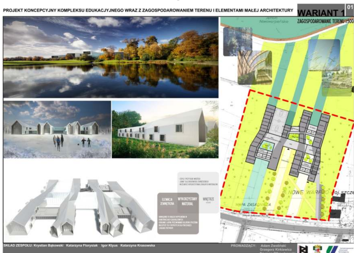
Figure 7 The concept of an educational center in Nowe Warpno

The architectural concepts of the Education Centre (Figure 7) were created by students of an architecture course at West Pomeranian University of Technology in Szczecin, organised by Nowe Warpno's mayor. Teaching by experiencing was the idea of the project. The concept a building project occurred however investment won't be implemented as they aren't able to guarantee an appropriate amount of pupils. It is a great financial and a bigger missed opportunity. Creating such a modern school could've attracted students from centres of Szczecin, Police and German Luckow or Altwarp. By following this example, investors ready to live in Nowe Warpno (with perfect opportunities for their children) and some summer-houses, would've been possible.