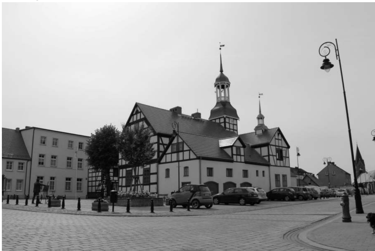
Figure 2 Revitalization of town hall in Nowe Warpno

fishing bay port and a headquarter department of a fishery master. Thanks to the war has spared Nowe Warpno, it kept its urban planning arrangement and the main buildings, along with exceptional monuments such as : Town Hall (Figure 2) and Assumption of the Virgin Mary. A fishery and a boatbuilding still remained in the economy. In spite of restoration and touristic activation projects made in the town, the monochrome lifestyle has changed in 1996 , when the duty-free border crossing between Warpno and Altwarp (DE) was opened. The opportunity of cheap alcohol purchase attracted visitors to Nowe Warpno. However they remained indifferent to city charms by shopping at the port market. The time period connected with the border trade ended along with the European Union and the "Schengen zone". From this moment on we can observe the decline of the fishery, which is associated with permission to compensational cutter-scrapping and Nowe Warpno started plunging into the slump, along with vanishing of passenger fishing cutters.