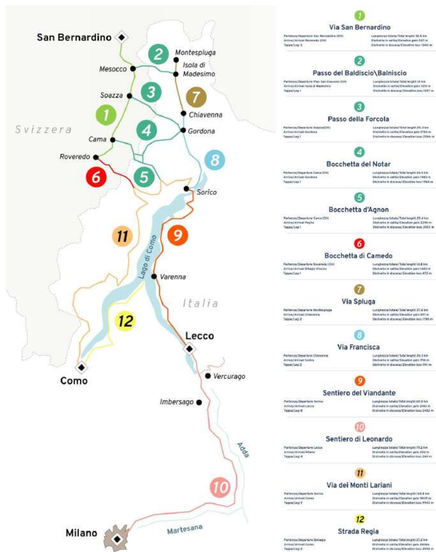
Figure 2. Itineraries crossing the inner area and neighbouring municipalities.