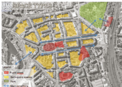
Proposed space types based on Google Maps