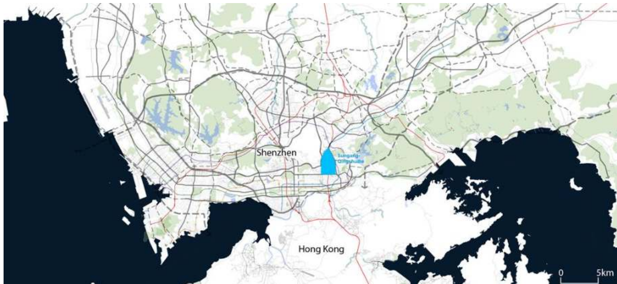
Figure 1: Location of SQ in Shenzhen.

SQ district is a 540-hectare outdated logistic center in Shenzhen. It represented the manufacturing history of the city, and witnessed the dramatic urbanization of Shenzhen in the past 30 years. The site is centrally located in the Luohu district, the first city center, and is well connected to the city infrastructure and transportation networks as shown in Figure 1. The former North station in the site connects Hong Kong and Mainland China, making the site a gateway of Shenzhen.