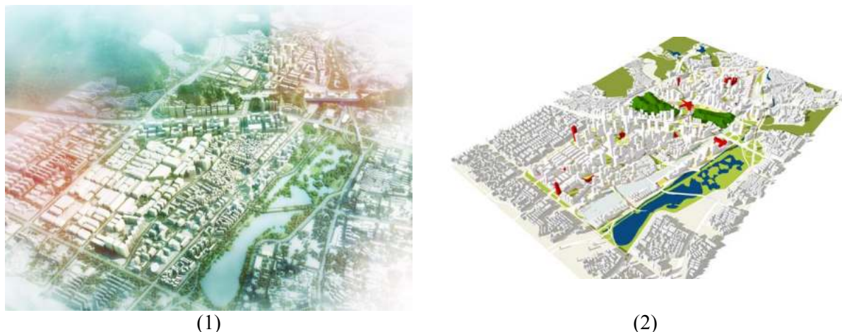
Figure 4: (1) Birdseye view of conceptual masterplan for SQ. (2) Three dimensional volumes of overall urban design guideline.