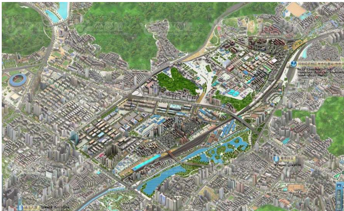
Figure 2: Three dimensional visualization of the existing urban conditions.