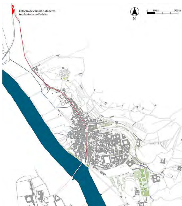
Figure 1 American car route in 1874 (Calmeiro, 2015: 285)

Regarding the creation of a public transport network, the process was not so fast or simple. The first attempt occurred in 1874 when American Car started to connect the railway station to the city centre (as seen in Figure 1) but lasted only eleven years. In 1885, the new train station near the river in the downtown led the Conimbricense Railroad Company to close. Before that, they had proposed a new line to connect to the Alta, but the new Santa Cruz neighbourhood was not yet built, and the proposal was considered impracticable.