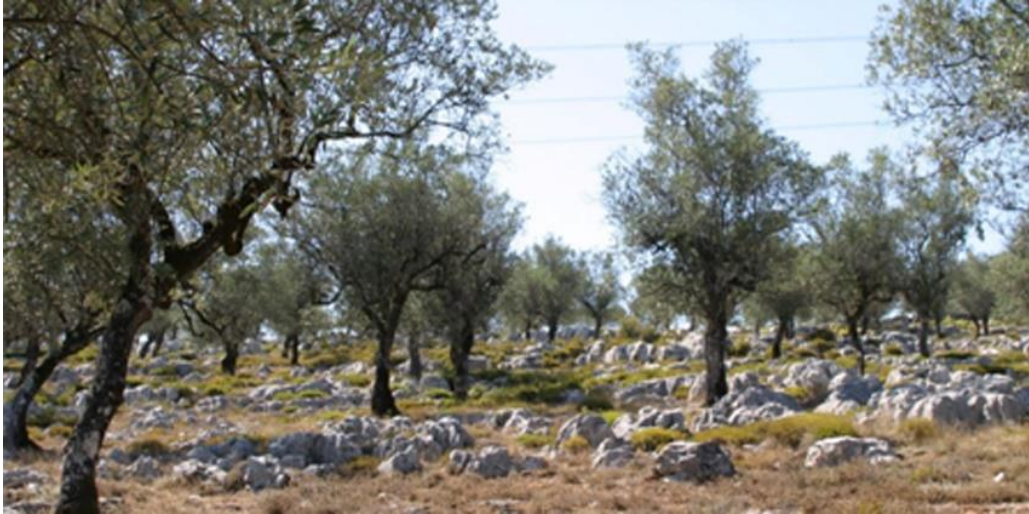
Figure 2. Field of stones (Lapiás)