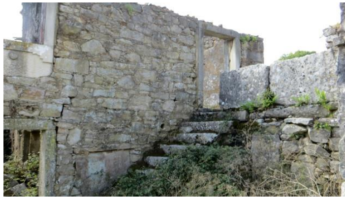
Figure 9. Cisterns for rainwater storage under the stairs in Chanca

Another village from the Rede de Aldeias do Calcário is the village of Casmilo. This village is in the Condeixa municipality and is also located in the middle of the hillside and near two dolines, one that is still visible today and another that was covered with earth and therefore only the local community can localize it. Casmilo is a bigger settlement than Chanca and apart from the olive oil production, its main activity was cattle-raising, having still today several flocks. Its proximity to Condeixa and Coimbra has allowed the village to maintain much of its dynamism, although today the population no longer depends on agricultural activities, and mostly works at the municipality's centre or even in Coimbra. However, it is still possible to observe a set of buildings of vernacular architecture that retain their original characteristics. Despite being used today mostly for agricultural or animal storage. Like Chanca, the vernacular architecture buildings are