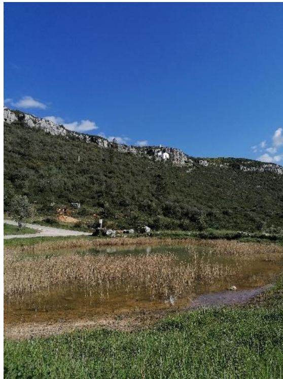
Figure 3. "Dolina" near Poios Village