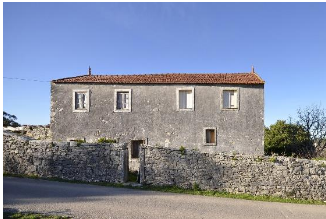
Figure 6. Limestone Building in Chanca

However, the village of Chanca located on the hillside, does not benefit from the same fertility of the valley and is deeply marked by the stone landscape. Man gradually cleared the fields to cultivate them, and today dry stone walls remain. Near the village, there is a “dolina”, crucial to feed animals and the fields. Besides this water point, there are also some wells for collecting groundwater and many buildings have cisterns for collecting rainwater. In the village, there are several buildings in ruins or in bad state of conservation. But it is possible to verify that most of them are composed of a two floors main volume for housing and a set of other volumes for agricultural annexes and animals. To have access to water, these buildings have a cistern to collect rainwater.