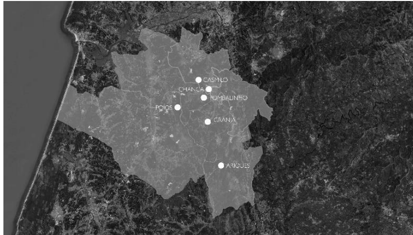
Figure 5. Network of Limestone Villages, 1st phase