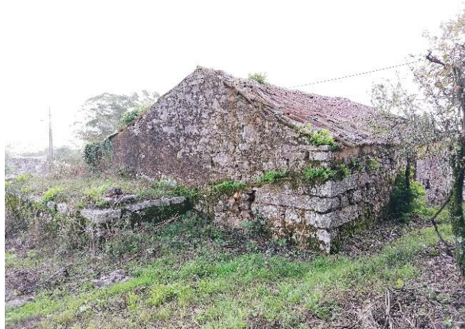
Figure 10. Tanks outside of the building, visible the channel conducting the water from the roof

constructed of stone masonry, laid with argil mortar, interior structure in wood and ceramic tile roof. Most of the buildings have two floors, with the ground floor being occupied by agricultural or animal storage and the upper floor for housing. The masonry of limestone, some balconies and chimneys and some decorative elements next to the windows stand out. Also, in this village cisterns for rainwater storage are common, located under the stairs or in tanks on the outside of the building. The location under the stairs facilitated the construction and extraction of water but required greater attention to the impermeabilization of the walls.