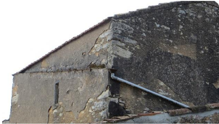
Figure 8. System of channel and pipes conducting the water from the roof