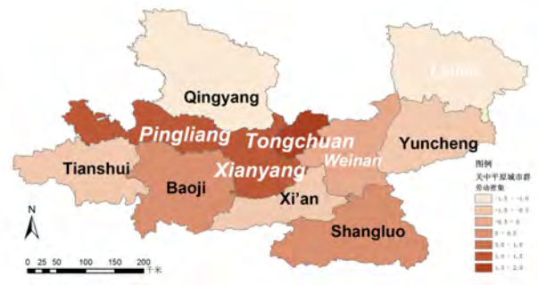
Figure10: Distribution of eigenvalues of Labor-intensive Manufacturing Industry in Guanzhong Plain urban cluster in 2016