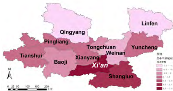
Figure5: Distribution of eigenvalues of technology-intensive manufacturing industry in 2016

According to the relevant planning interpretation, only one city in Xi'an is a first-class city. Its current situation has the advantages of high value sector industry department, and its future leading position in the development of urban cluster industry can be maintained. (Figures5 and 6)