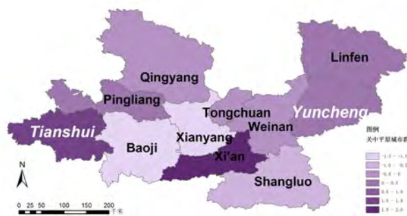
Figure9: Distribution of eigenvalues of Other Services in Guanzhong Plain urban cluster in 2016