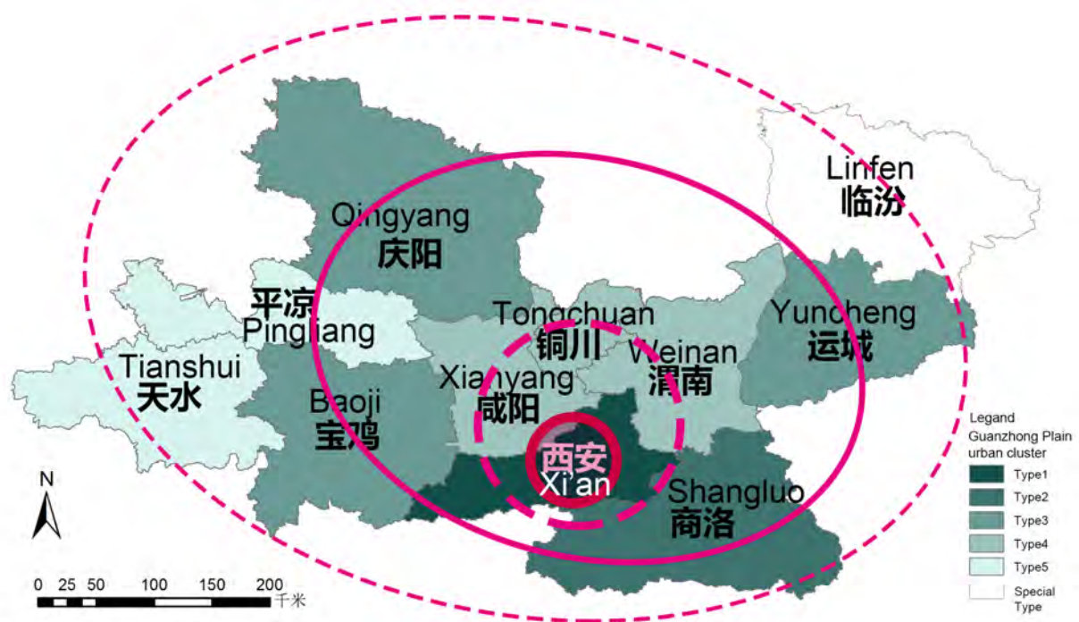
Figure2: Industrial pattern of Guanzhong plain urban cluster based on value-added hierarchy

It is the fourth circle composed of Tianshui, Pingliang and Linfen. In this circle, Pingliang and Tianshui have limited mineral resources, mainly agriculture and low industrial value, while Linfen presents the phenomenon of excessively single industrial structure that other industrial sector is abnormally prominent and the manufacturing level is far behind the regional average.