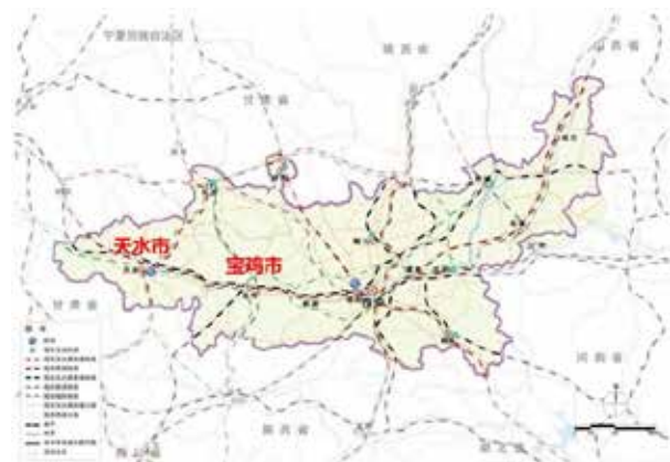
Figure8: The traffic network planning of Guanzhong Plain urban cluster