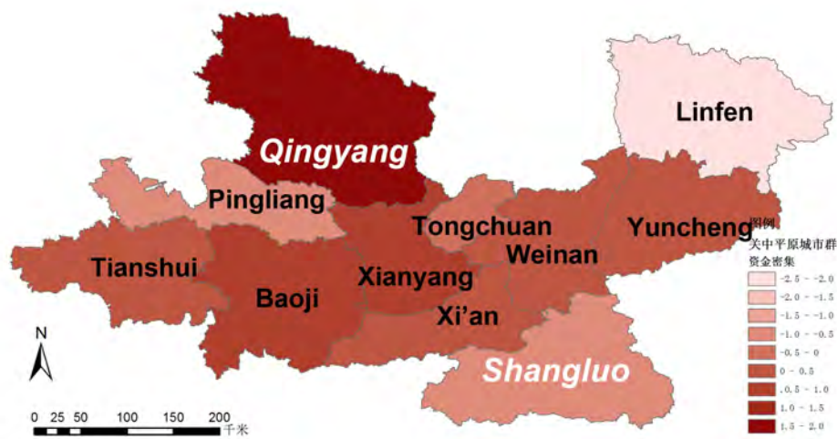
Figure 11: Distribution of eigenvalues of capital-intensive manufacturing industry in Guanzhong Plain urban cluster in 2016

forms a technology-intensive industry cluster area with Xi'an. The planning requires that its industry return to agriculture is counter-trend and unreasonable.