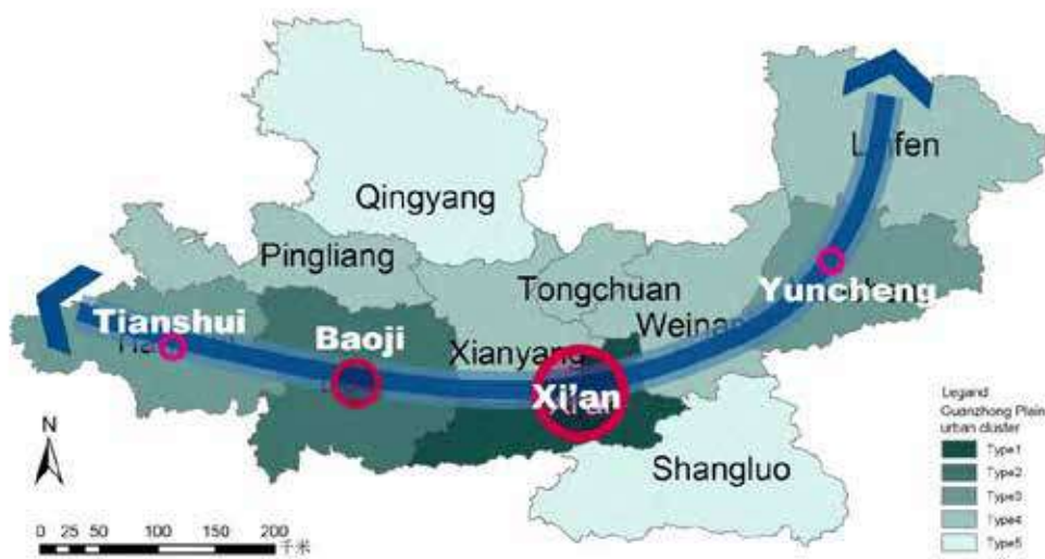
Figure4: Industrial pattern of Guanzhong Plain urban cluster based on “the Planning”