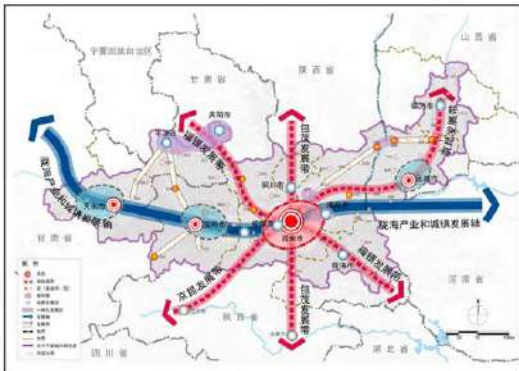
Figure3: Spatial pattern of Guanzhong Plain urban cluster (source: translate according to the Guanzhong Plain Urban Cluster Development Planning )

In February 2018, the National Development and Reform Commission approved “the Guanzhong Plain Urban Cluster Development Planning (2017-2035) ” (hereinafter referred to as the Planning ). The Planning period lasts until 2035. The spatial layout and industrial system of Guanzhong Plain urban cluster are clearly defined in “ the Planning ”: Taking the construction of National Central City and regional key node city, Xi'an, as the carrier to accelerate the development axis and growth pole and build the overall pattern of ‘one circle, one axis and three belts’ (Figure3). And build an important base of advanced manufacturing industry, strategic emerging industries and modern service industry in China, promote the industry from the low end of the value chain to the high end, and promote the development of northwest and surrounding areas by radiation. While deepening the core functions of Xi'an, it also emphasizes accelerating the development of regional coordination.