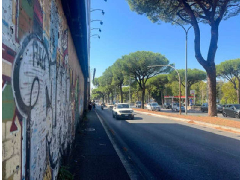
Fig. 2: Rome, the wall of the former fair pavilions, from the Via Cristoforo Colombo axis