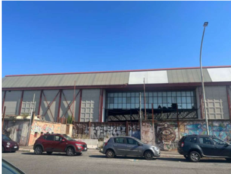
Fig. 2: Rome, the former fair pavilions, from the main entrance