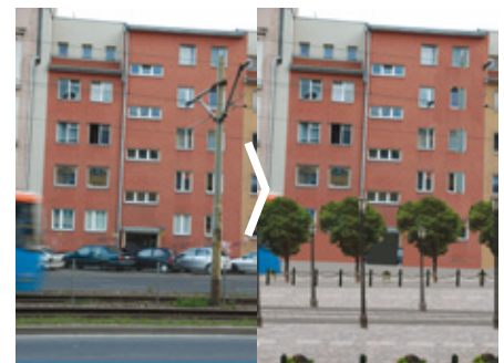
Kazimierza Wielkiego old and new