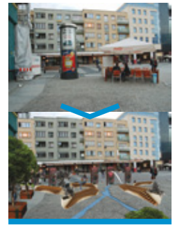
Oławska old and new