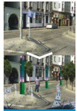
Św. Antoniego old and new