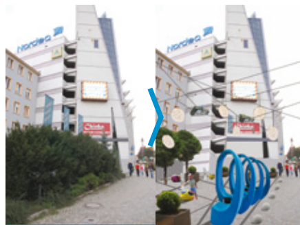
Kazimierza Wielkiego old and new