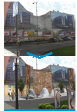
Zamkowa old and new