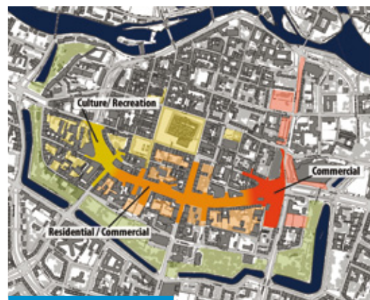
Existing situation - functional distribution

Kazimierza Wielkiego distinguishes different main < functions. We aim to keep this functional division and develop public spaces fitting to its characters located along this road. On the cultural stretch of the road we propose to deepen the pathways to provide open air spaces for cafes and bars and to implement visual elements to attract people. On the commercial part, wide pathways are important elements as well, in order to give the possibilities to transform this part into a more lively area with broader commercial offers. On the part with adjacent housing some of the sidewalk width is allocated to a row of parking spaces to satisfy the needs of residents and local citizens.