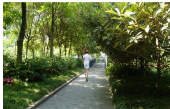
Figure 10. A Run way