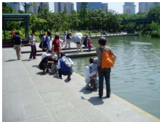
Figure 14. A good view of landscape