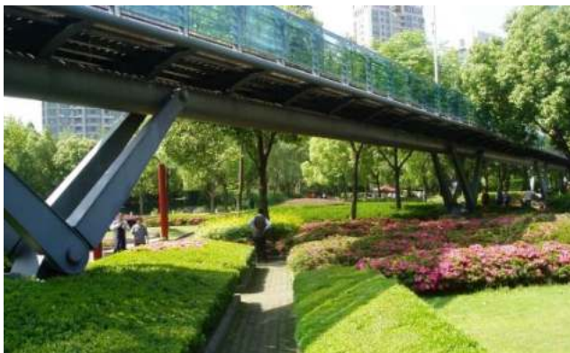
Figure 2. Landscape bridge of Xujiahui Park

mystical veil of history. And walk along, as you stand on the landscape bridge which bridging upon the park that old map of Shanghai emerge from there. Visitors overlook the whole history on the bridge, all kinds history stories were combined together to arouse visitors sense of history mission. Meanwhile, visitors can also overlook the river system which as a supporter element connect time and space in the park. The river symbolize as Huangpu River which was called as a mother river of Shanghai, dividing the park into two parts to show the different urban texture about Pudong and Puxi in Shanghai. The river tell us a continuous story about the development of Shanghai history from industrial age to nowadays. At the end of the bridge is a view of the thinking about future by landscape designer. (Figure 2 Figure 3)