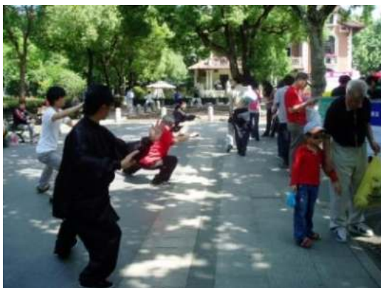
Figure 13. Activity space in Surround close

Landscape Divided into two parts: Landscape and the viewer of Landscape. When landscape architects begin to design he must be clear about why do the landscape? And who is the viewer? There is no doubt that Landscape design is done for the viewer, and the design process must be standing on the position of the view. Therefore, a good design must be "people-oriented", "based on people's feelings"(The Feelings mentioned here, on the one hand there is a part of the geopolitical foundation, on the other hand is arises spontaneously). Furthermore, the landscape design is by taking advantage of good story with the surface of the earth to touch visitor heart and give visitor ups and downs of emotion.