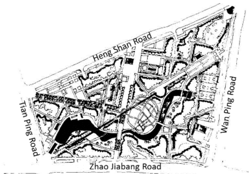
Figure 4. Site-plan by hand painting Xujiahui Park

Xujiahui Park making the history of Shanghai as a clue and connecting the tradition culture with society, Reappear a view of the location original live in modern landscape. Old and New human landscape were connected by modern technology to achieve symbiosis of old and new space-time, making Shanghai culture inherited. (Figure 4)