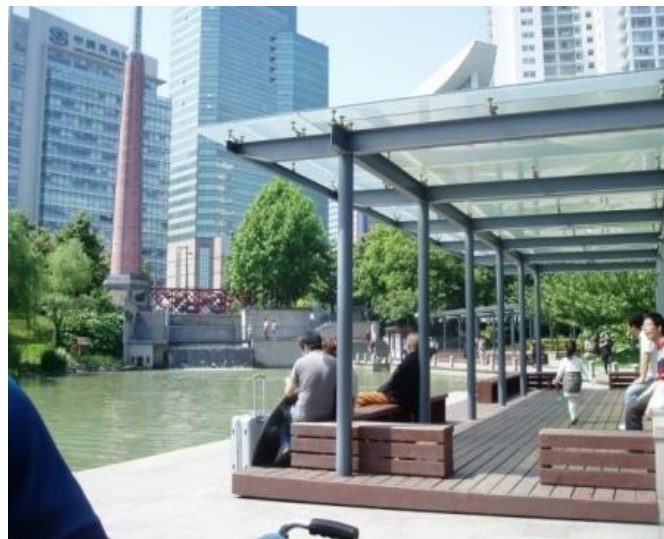
Figure 6. A Strip Reflecting Pool