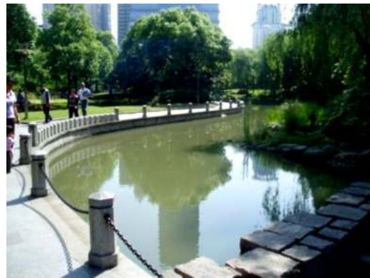
Figure 3. River system of Xujiahui Park

Xujiahui Park making the history of Shanghai as a clue and connecting the tradition culture with society, Reappear a view of the location original live in modern landscape. Old and New human landscape were connected by modern technology to achieve symbiosis of old and new space-time, making Shanghai culture inherited. (Figure 4)