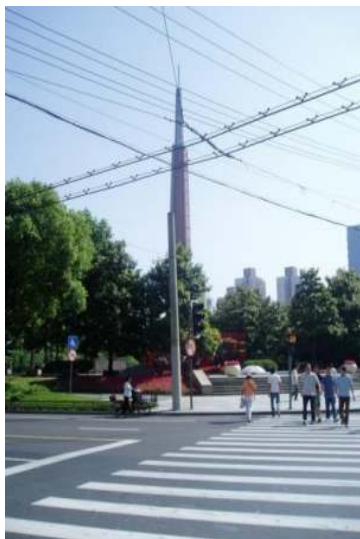
Figure 5. The entrance of chimney

Landscape architect use modern way to build a landscape pool which the chimney reflected in. It is also a way make Geographical element Integrated into the Modern landscape. Although the pool look like simple but it Has profound connotation. Changing the water reflection of the sky, Dynamic and static, virtual and real, old and new combination gives the pool of life. (Figure 6)