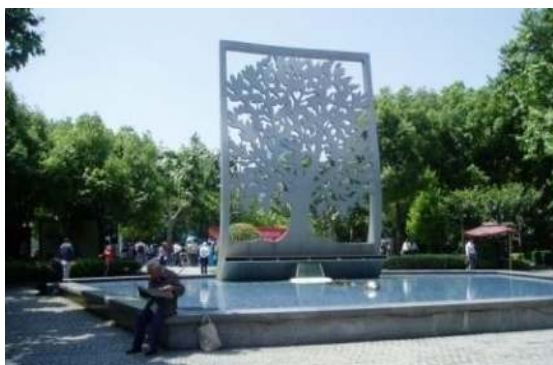
Figure 9. Creative sculpture in Xujiahui park