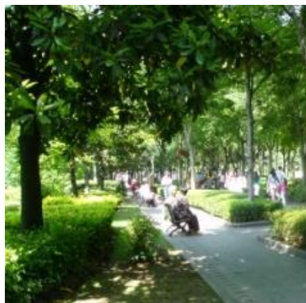
Figure 11 Rich levels view Figure 12. Variety of activity space

In each landscape nodes to use of building envelopes, different materials contrast and collage, configuration of the different plants, forming a series of different sizes and rich layers of space. (Figure 11, Figure 12) Different spaces attract different people and Gather a variety of activities; The same spaces at different times will attract different activity groups and rich activities. Bring to different ages viewer an experience which will be much more exquisite and stimulate their inner feeling.