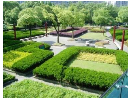
Figure 8. The map of Shanghai made by plants