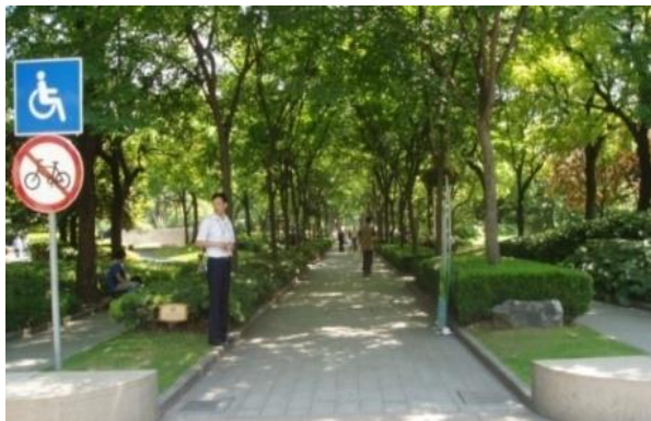
Figure 7. The plants design of walkways

Overlooking on a bridge, the map of Shanghai was performed by plants, combination of modern plant and historical residences form, bring the viewer strong visual impact. (Figure 8)