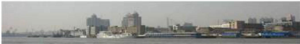
Figure 5-2-7 original riverside interface

The building interfaces formed by warehouses are the major interfaces in riverside area (Figure 5-2-7). We keep the space pattern and culture elements of the original interfaces, and change the utilization of the warehouses (Figure 5-2-8).