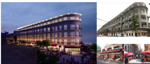
Figure 5-2-15 Existing space between 3# and 4# warehouse and the transformation