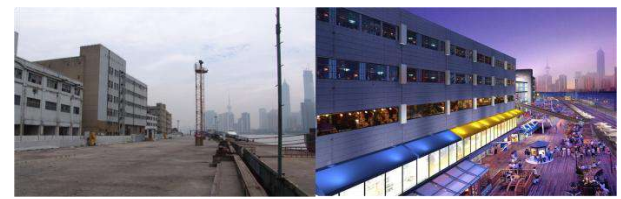
Figure 5-2-12 Existing 2# warehouse and the transformation