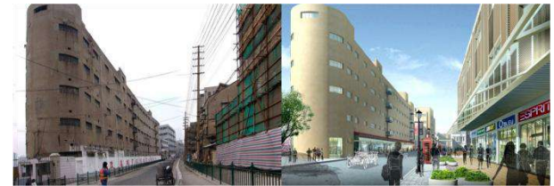
Figure 5-2-13 Surrounding of 1# warehouse and the transformation