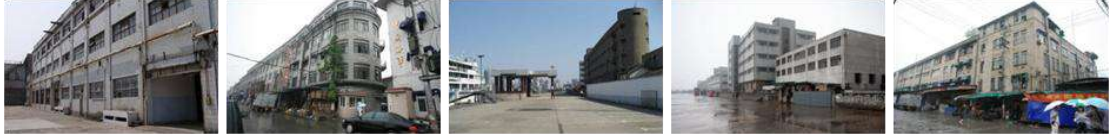
Figure 5-2-1 The five warehouses along the river