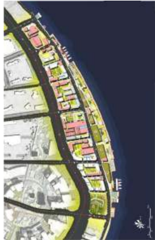
Figure 5-2-4 planned texture of the site

Figure 5-2-3 and 5-2-4 show the original and planned texture. By analyzing the index factors of city texture with the methods of experts scoring and AHP , we can get the comprehensive assessment (Table 5-2-4).