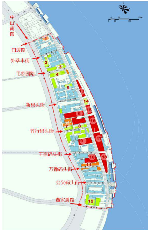
Figure 5-2-3 original texture the site