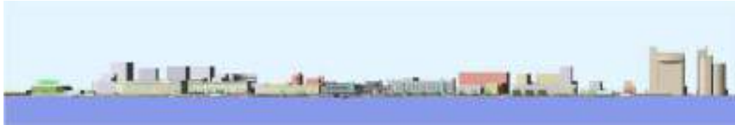
Figure 5-2-6 planned skyline