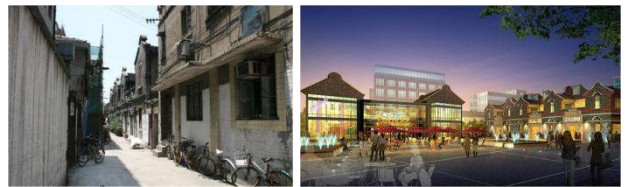
Figure 5-2-14 Inner court of Jiqingli and the transformation