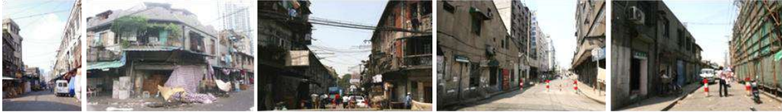
Figure 5-2-2 Main streets

“Competition for the wharf” reflects the importance of wharf in the time of water transportation. The streets lie perpendicular to the river densely (Figure 5-2-2). Streets are named after different industries, families and areas.