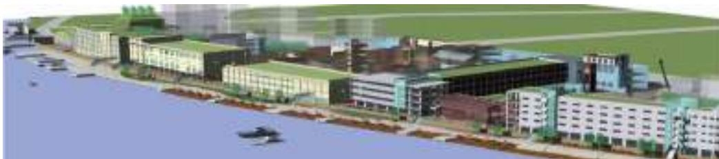
Figure 5-2-8 planned riverside interface