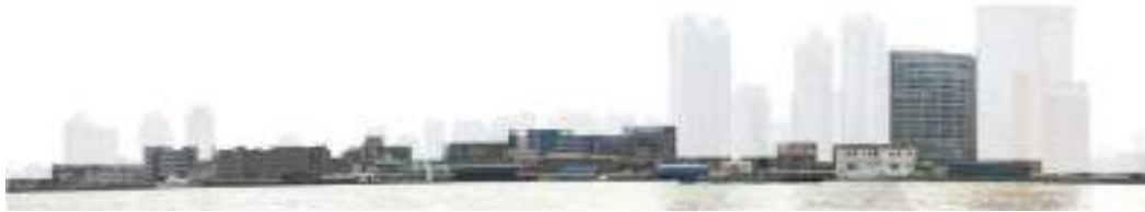
Figure 5-2-5 original skyline