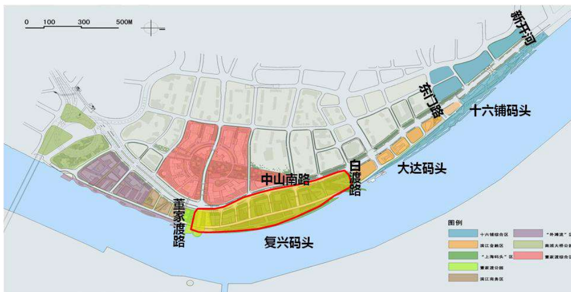
Figure 5-1-1 Location of Fuxing Wharf