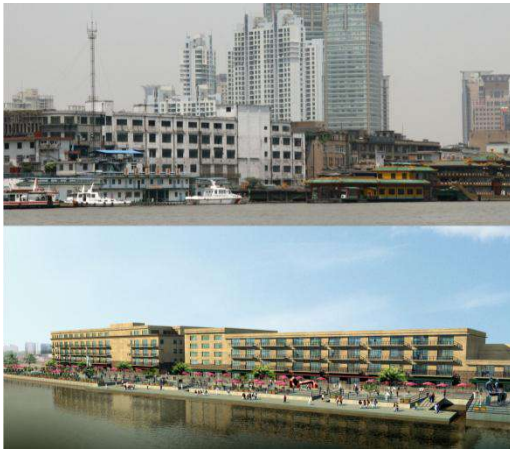
Figure 5-2-10 Existing 4#5# warehouse and the transformation